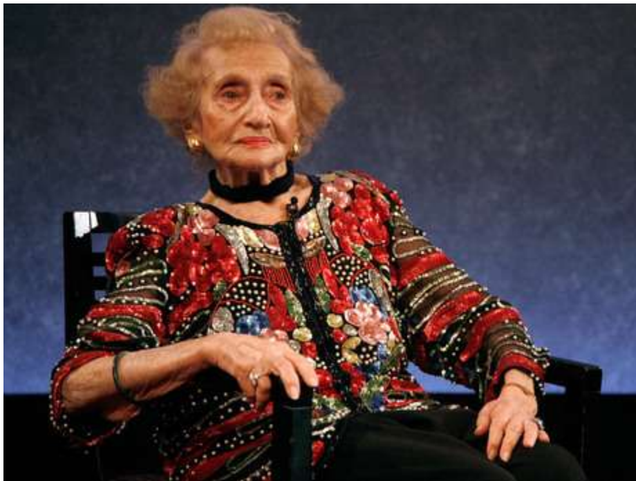
Ruth Gruber attends a tribute organized in her honor, in New York City in February 2011.

"So I got a cable back from this company that had bush pilots: 'See you Tuesday, weather permitting.' Tuesday came, no pilot. Another Tuesday came, no pilot. I'd send another cable. No pilot. In New York, if the train was late, I was raring to go. What was the use getting upset in Alaska? So I decided I would just live inside of it like a golden bubble."