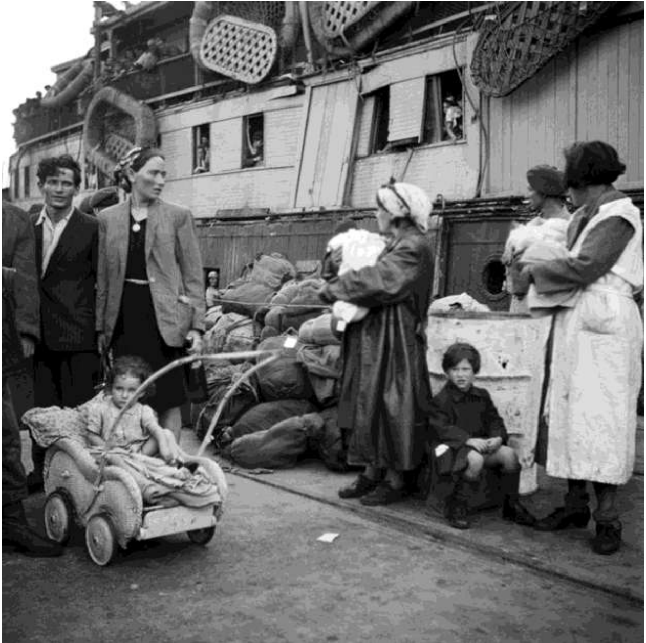
Refugee families from Exodus awaiting forced deportation and transfer to prison ships at Haifa Port, July 18, 1947