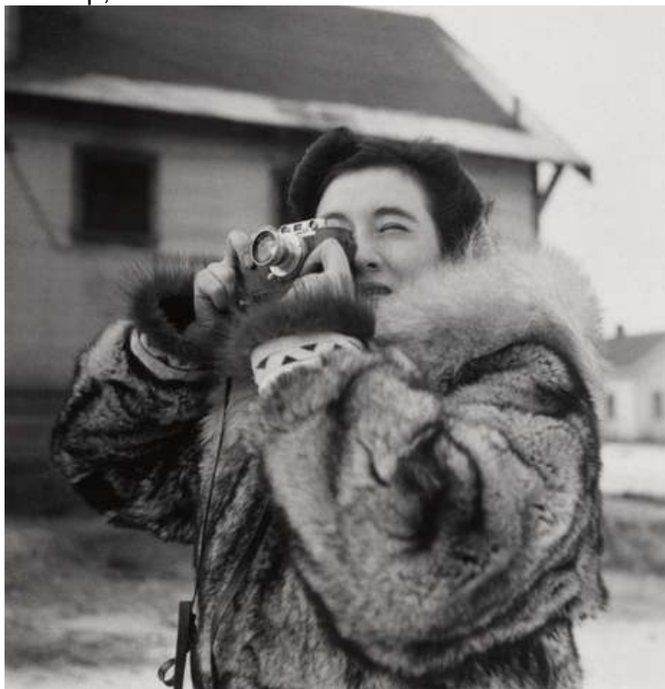
Ruth Gruber, Alaska, 1941-43

At the age of 100, Ruth Gruber is responsible for a lot of firsts. When she was just 20, she became the youngest Ph.D. ever at the University of Cologne in Germany. She was the first photojournalist, much less female journalist, to travel to and cover both the Soviet Arctic and Siberian gulag. She documented Holocaust survivors and the plight of the ship, the Exodus 1947 .