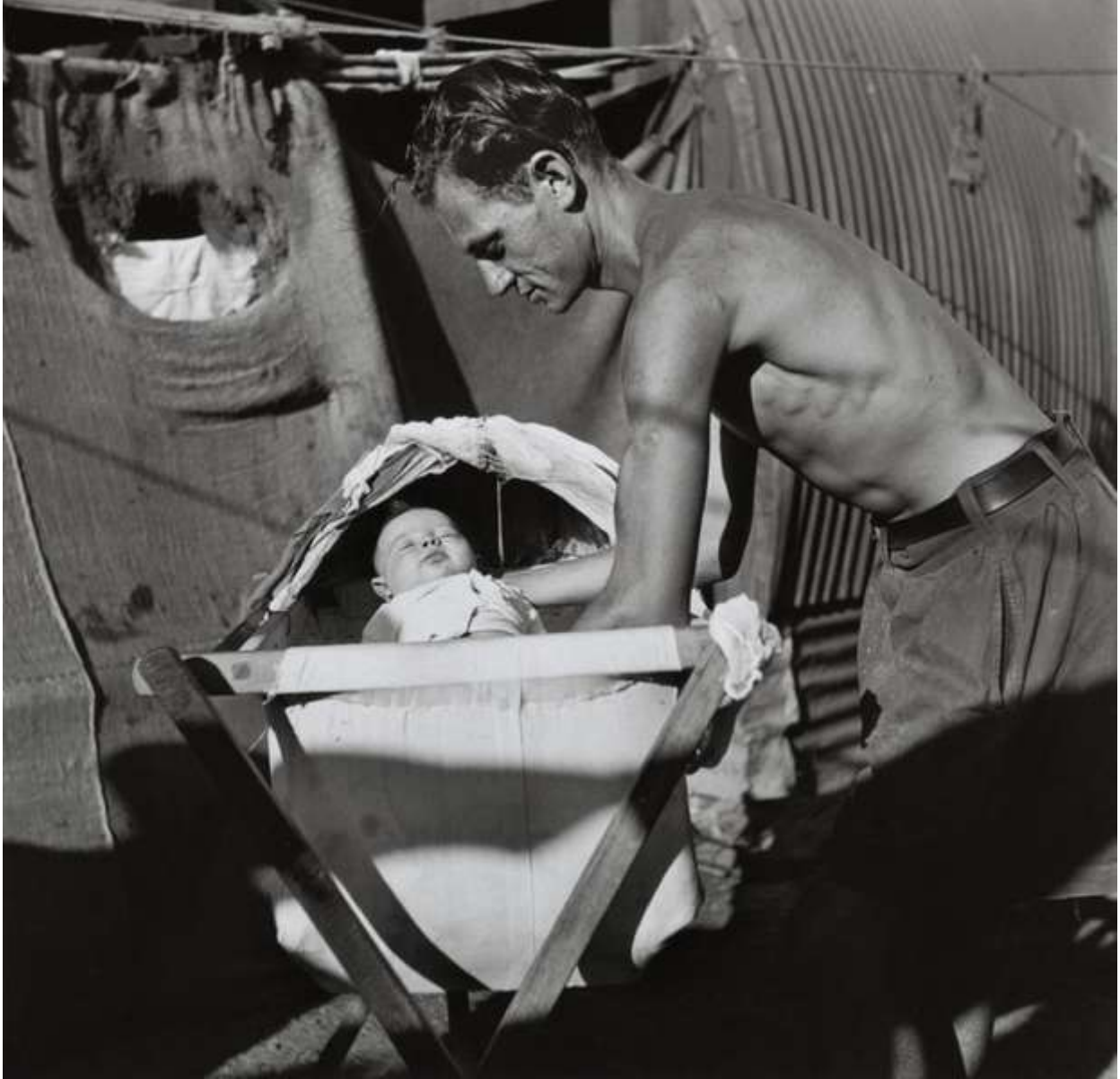
A father puts his baby to sleep in a bassinet constructed from gathered rags and pieces of wood, Cyprus Internment Camp, 1948