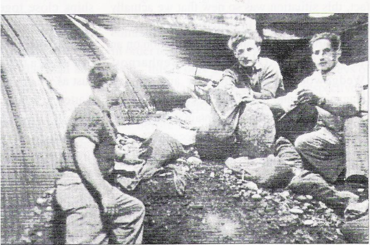
Excavation of tunnels for smuggling the detained from the camps in Cyprus

and said, "Dad, I was born 40 years too late!" Today, she is a mother and kibbutz in the Jordan Valley.