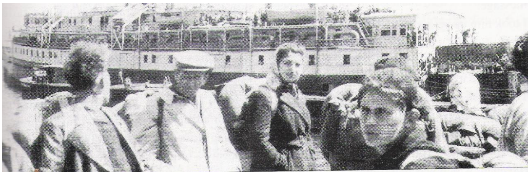
The last people embarking on the "Exodus" in "Sete" port, France

He was a driver in the Upper Galilee Trucking Cooperative (Galil Elyon) , and for Egged, the bus cooperative. For many years he sailed as purser on passenger ships of the Zim lines and of the American Export Lines. He lived for many years in Jerusalem and worked as a tourist guide, and died there at the age of 69.